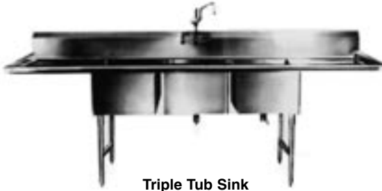
Triple Tub Sink