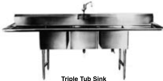
Triple Tub Sink