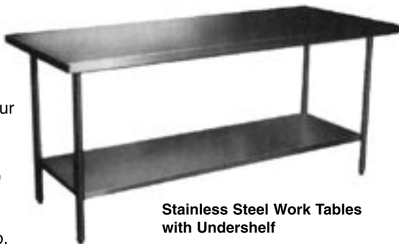
Stainless Steel Work Tables with Undershelf