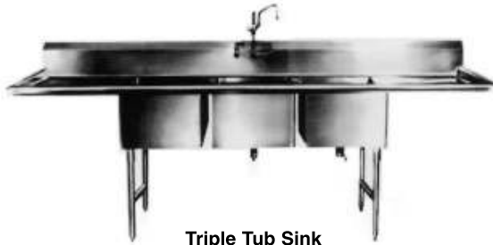
Triple Tub Sink