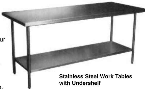
Stainless Steel Work Tables with Undershelf