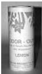
Packed: 12 cans/case